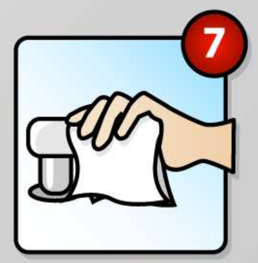
Use the paper towel to turn off the tap so your hands remain clean.