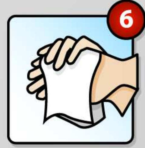
Dry hands completely with clean paper towels.