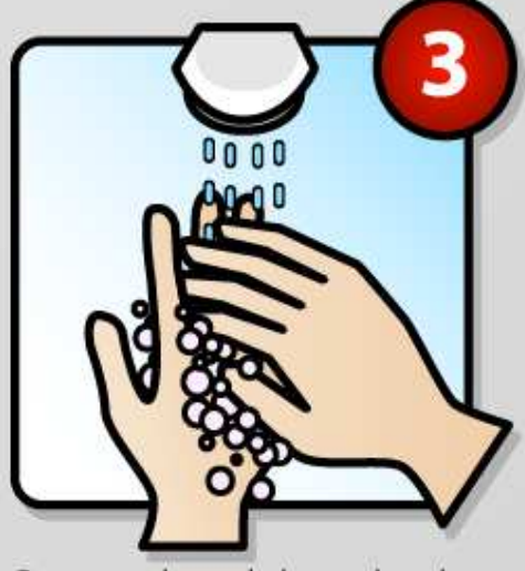
Generate a heavy lather and wash well for approx. 15 seconds . Clean between fingers, nail beds, under fingernails and backs of hands