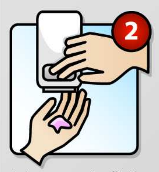
Apply a generous portion of liquid soap.

Turn on water to a comfortable temperature and moisten hands and wrists.