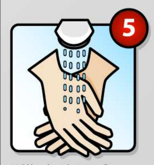
Hold hands so that water flows from the wrist to fingertips.